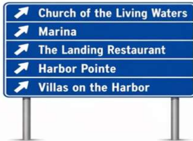
Directional Sign at Intersection of Moonbrook Drive & Dogwood Trail Directing Traffic to Continue on Moonbrook Drive

The new signs designate Dogwood Trail as a “No Thru Traffic” and “No Trucks” roadway designed for residents and guests only. Additional directional signs have also been installed to guide drivers on the preferred alternate route around the community.