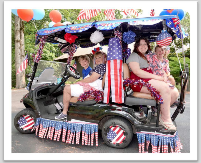
JOIN THE FUN!