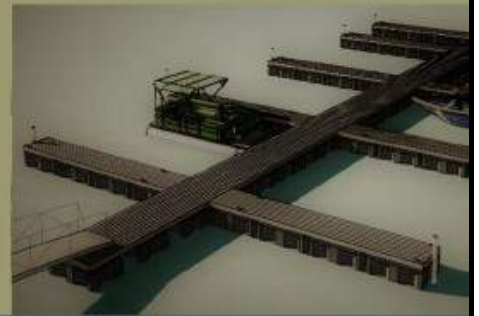
Personal Water Access