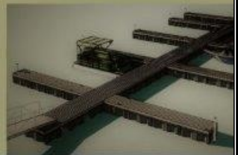
Personal Water Access