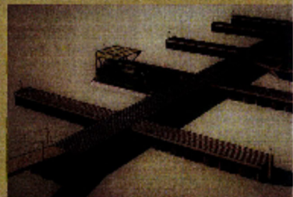
Personal Water Access